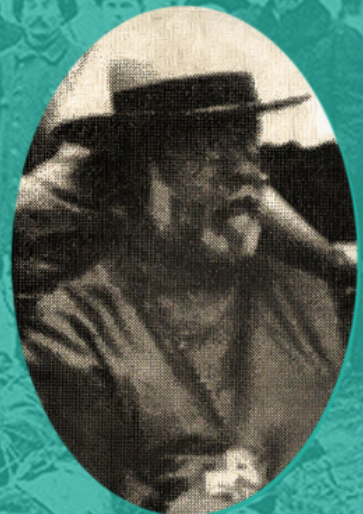
Archpriest Dimitry Chistoserdov (1861–1919)