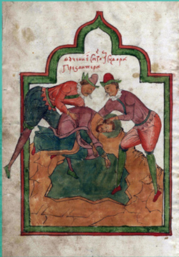
The hieromartyr Isidore the Priest