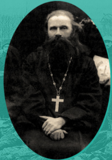
Archpriest Mikhail Bleive (1873–1919)