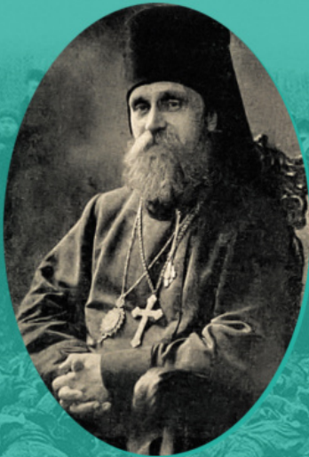
The hieromartyr bishop Plato (1869–1919)