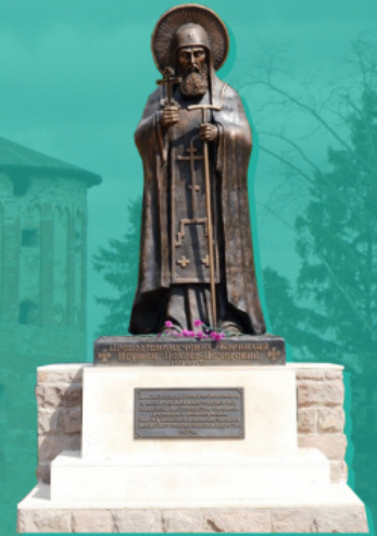
Monument to the Venerable Martyr Cornelius, abbot of the Pskov Monastery of the Caves

The Orthodox confessing of Christ was renewed here in 1841 when a spontaneous movement arose (going against, incidentally, 'local traditions' and the state imperial policy in the Ostsee region) by which Latvian and Estonian peasants converted to Orthodoxy. The persecutions enacted against them by the Ostsee German nobility were especially harsh.