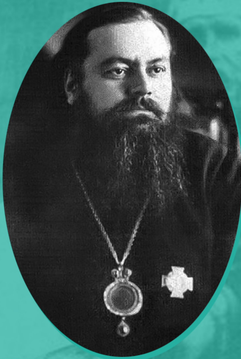
Metropolitan Sergius (Voskresensky) (1897–1944)

Baltic Countries metropolitan Sergius (Voskresensky), and in essence the decision of the episcopal council of the Exarchate of the Baltic Countries (since the degree was signed by the bishops of Mitau, Narva and Kovno), metropolitan Alexander had been suspended from priestly functions as a result of repeating the schism and dismissed from administering the diocese of Tallinn (with the result that the condition of the 16 th Canon which forbids transferring a bishop from his see before his guilt has been ascertained had been fulfilled).