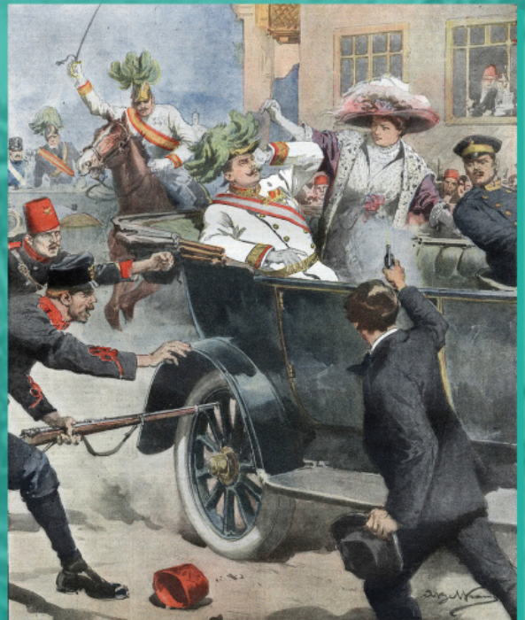
Assassination of Archduke Franz Ferdinand and his wife Illustration by Achille Bertrame, 1914

The relations between the Serbs and Croats remained extremely tense during the existence of the Kingdom of Serbs, Croats and Slovenes and later in Yugoslavia (since 1929), because the new state was unitary in character, which did not suit the Croatian population. In addition, the Vatican was playing an active role in the inter-ethnic hostility. The purpose of the so-called Catholic Action that was being carried out by the Vatican was to involve young people in various religious organizations, such as the "Eagles" or "Crusaders," and to continue the policy of catholicization of the Serbs and Bosnians.