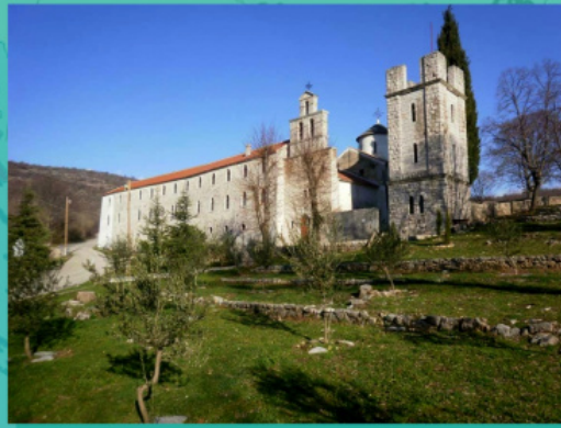
The Krupa Monastery