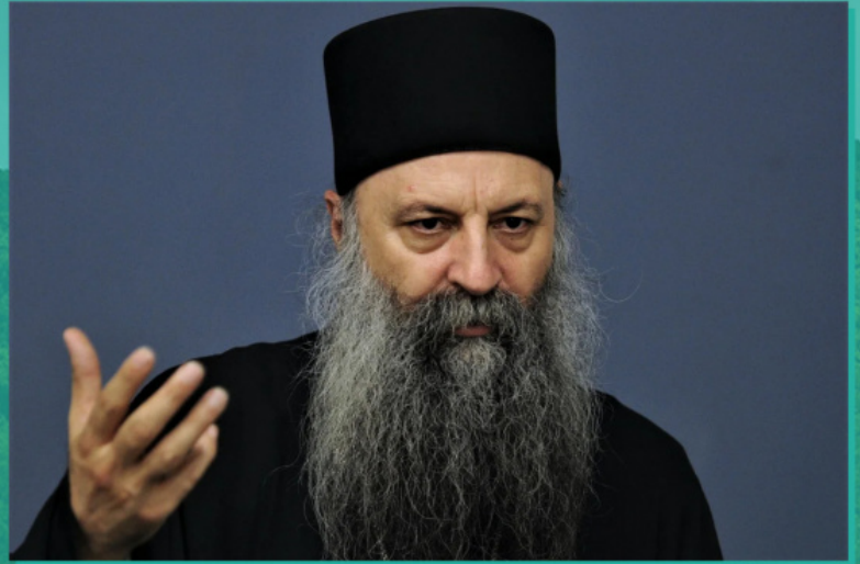
Patriarch Porfirije of Serbia

In 2014 the Episcopal Council of the Serbian Orthodox Church elected a vicar bishop of the Bačka diocese Porfirije as Metropolitan of Zagreb-Ljubljana. He was enthroned by Patriarch Irinej of Serbia in the presence of many hierarchs of the Serbian Orthodox Church at the Cathedral of the Transfiguration of the Lord in Zagreb on June 13, 2014. Metropolitan Porfirije has become far-famed for his public and peace activities aimed at the strengthening of Orthodoxy in the region. During his tenure of office, the renovation of the Lepavina monastery, the oldest spiritual centre of the Orthodox Serbs in Croatia, was completed.