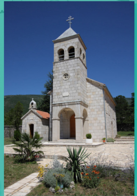
The Dragović Monastery

The Croats, unlike the Serbs, lost their independence quite early when in 1202 they became part of Hungary, having signed a union agreement with it. According to the statutes of the papal legate for Poland and Hungary of 1279, Orthodox clergymen could not buy or build churches without the permission of the Catholic bishop, while the Catholics were forbidden to attend divine services in Orthodox churches. However, the situation changed under the imminent Islamic threat, which made Christians unite in the face of common danger.