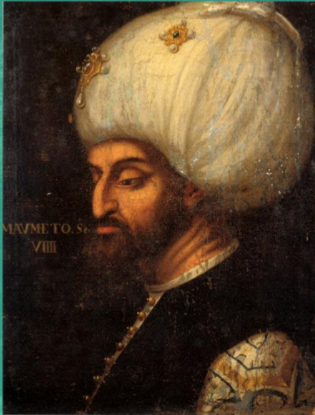
Portrait of sultan Mehmed II by Paolo Veronese, 1579