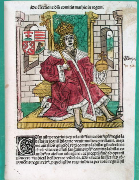
Mátyás Hunyadi (Korvin) A xylograph from «Chronicle of the Hungarians», 16 th c.

In 1526, Hungary suffered a crushing defeat from the Turks in the Battle of Mohács, and a large part of its territory went to the Ottoman Empire.