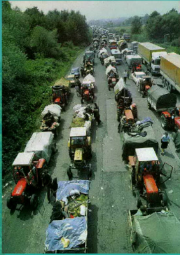
The flow of Serbian refugees, 1995