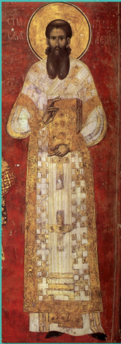
Sava of Serbia. Fragment of a fresco. Church of St. Demetrios. Serbia, 13 th c.