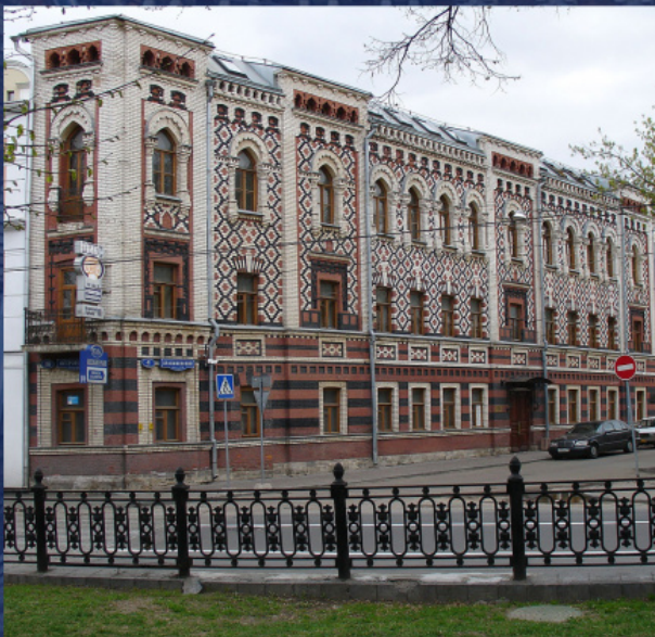
The living accommodation of the metochion of the Patriarchate of Constantinople. North-east façade.

The Synod of the Patriarchate of Constantinople adopted a memorandum defending the rights of persecuted Christians in Asia and Russia, condemning the Bolshevik campaign for confiscating church valuables and the arrest of His Holiness the Patriarch of Moscow and All Russia Tikhon.