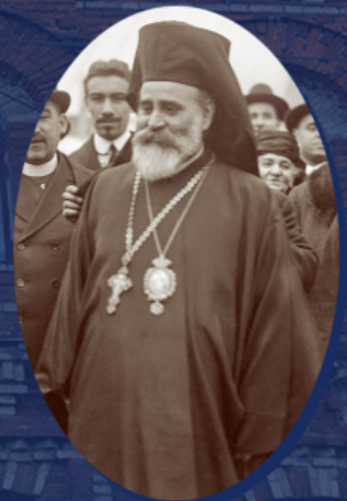
Patriarch Meletios (Metaxasis)