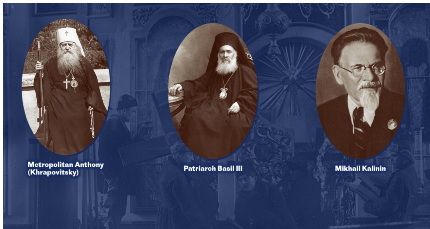
Metropolitan Anthony (Khrapovitsky)

Simultaneously, the Ecumenical Patriarch recognized the (Renovationist) Russian synod to be the official head of the Russian Orthodox Church and suspended from priestly functions bishops who fled Russia into emigration, headed by Anthony Khrapovitsky. All of these bishops were made subject to an ecclesiastical court.